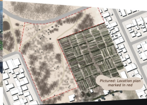
Pictured: Location plan marked in red