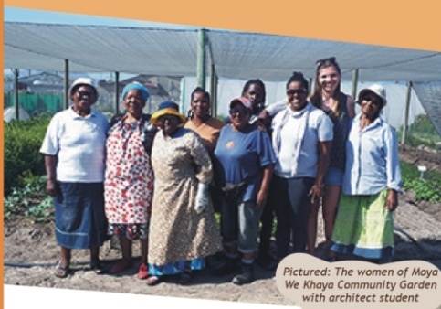
Pictured: The women of Maya We Khaya Community Garden with architect student

HlUMANi is a meeting place for the community, which is converted weekly into a packing station and selling space. It aims to strengthen connections between local vendors and farmers, while allowing for employment and training opportunities.