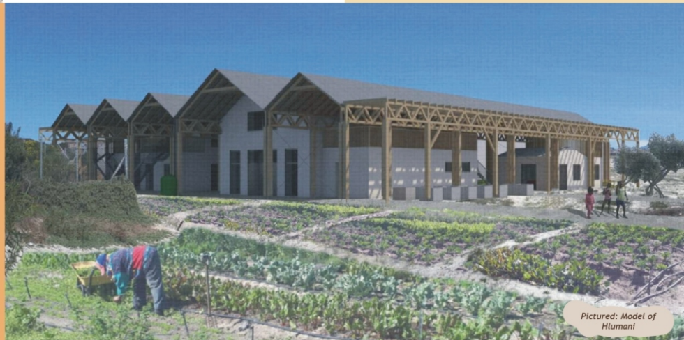
Pictured: Model of HlUMANi