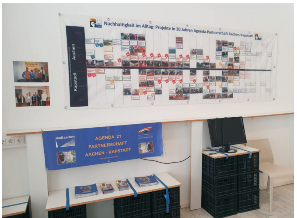
TIMELINE - all projects from 2000 to 2025