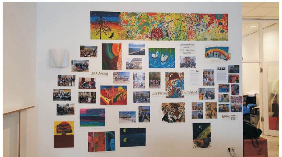
Artprojects during the school exchange Soneike High School - HHG