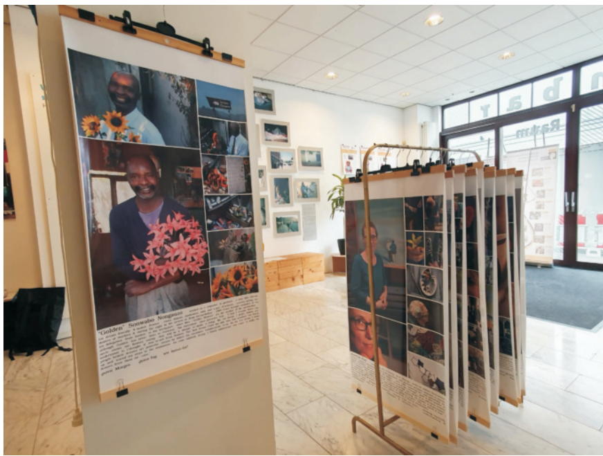
Above: Faces of a Partnership 2010