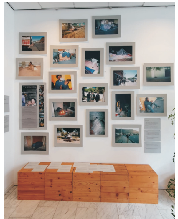
Right: 24 hours on the street – The other face of Cape Town