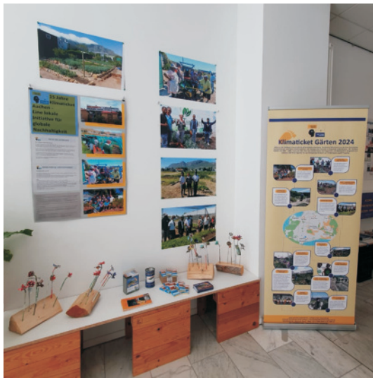
15 years Climaticket Aachen-Cape Town